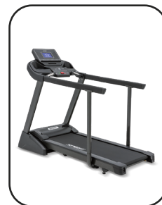
Optional Extended Handrails

The XT185 combines eye-catching aesthetics with the features you want in a quality home treadmill. With a bright 7.5" blue backlit LCD display, a wide variety of preset and customizable programs, and convenient handlebar pulse sensors, you have everything you need within view and reach. Our reliable PowerMax Motor is backed by a lifetime warranty while the 510 x 1400mm running surface with optional extended handrails can give those with a need for added support the security and confidence they need. The convenient folding-frame design features built-in Lift Assist and Slow Deploy while the transport wheels make moving and storage a breeze.